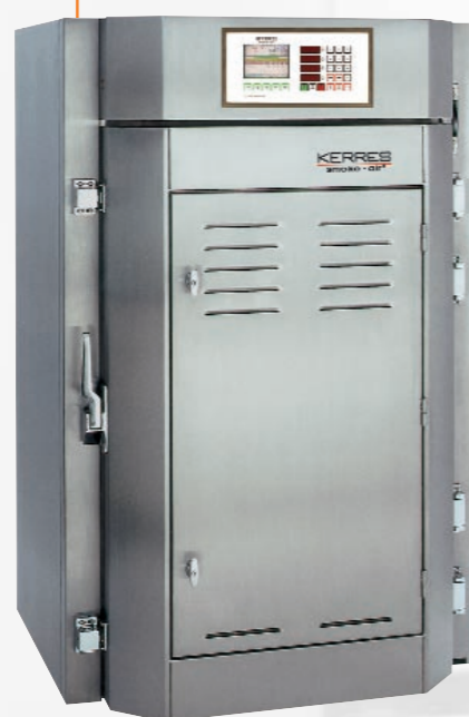
combined chamber 1600 RET-C