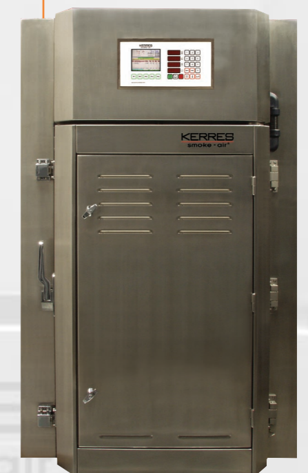
universal smokehouse JS 1250 RET-C